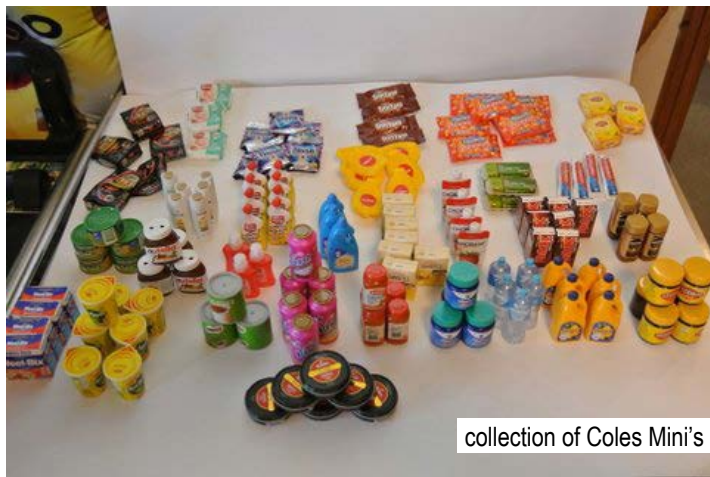
collection of Coles Mini's